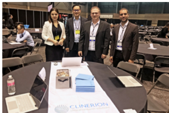
The Clinerion team at the 2018 ASCO Annual Meeting, Chicago, IL, June, 2018.